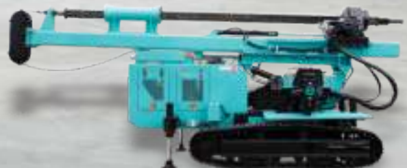
BORED PILE DRILLS EVOMAQ®