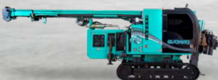
SMALL-SIZED CONTINUOUS FLIGHT AUGER (CFA)