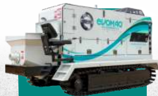
CRAWLER PUMP EVOMAQ ®