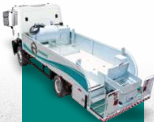
CONCRETE AUTO PUMP EVOMAQ ®

EXPLORE OUR LINE OF CONCRETE PUMPS FOR ADDITIONAL INSIGHTS