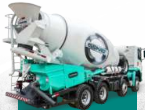
BETON CONCRETE PUMP EVOMAQ ®