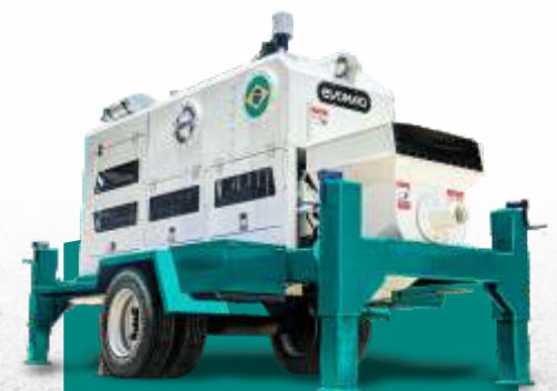
STATIONARY CONCRETE PUMP EVOMAQ ®